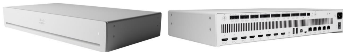
Figure 1. Cisco Webex Codec Pro

With its powerful media engine, the Room Kit Pro lets you build the video collaboration room of your dreams.