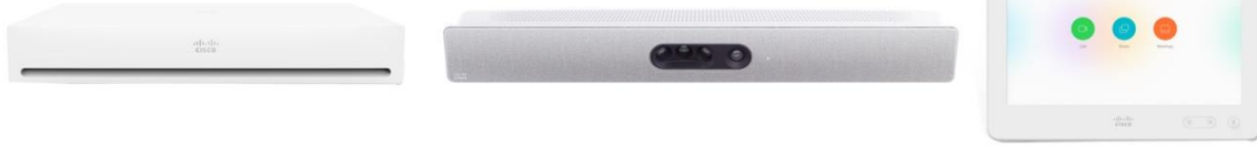
Figure 2. Cisco Webex Room Kit Pro integrator package with Quad Camera and Touch 10